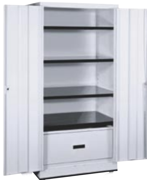
STORAGE W/LATERAL FILE